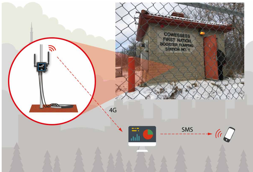
Diagram of the installation

The technology used is based on Libelium's Plug & Sense! Smart Water Xtreme with sensors to measure water depth and chemistry elements. The data is sent by 4G (Sasktel provided SIM) to communicate directly to Aridea's Terralytix Portal cloud platform . They chose Libelium's technology once again in this significant, historic project.