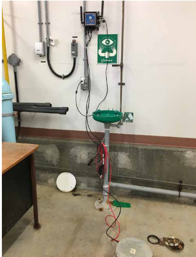
Aridea uses Libelium's P&S! Smart Water Xtreme for this project

Aridea has a broad experience with smart water projects in North America and has already worked with the Libelium's sensors to protect and conserve the habit of the beluga whale in Alaska and to preserve endangered freshwater mussels in the Ohio River .